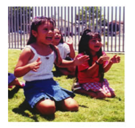
Los Angeles School Children at Play

It takes a village or, in the case of Los Angeles County, a neighborhood, to raise a child. To the extent that the quality of the community affects the mindset that students bring to school, to the extent that a strong and cohesive neighborhood can provide positive outlets for young people, and to the extent that schools can serve as community centers and catalysts for revitalization, the interest of the public agencies throughout the City, including the CRA and LAUSD, must converge.