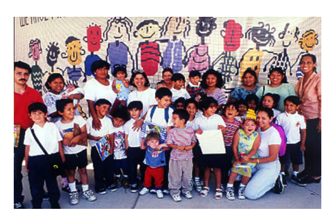
A Group of Los Angeles Area Students

mansions to small exquisitely detailed cottages. Westlake began to lose it exclusiveness as migration towards the coast increased in the 1940's. Today the roughly three-mile area is the most densely populated area in the city with approximately 34,000 persons square mile<sup>4</sup> and is an eclectic mix of overcrowded residential buildings and underutilized commercial properties, dotted with vacant lots and abandoned buildings.