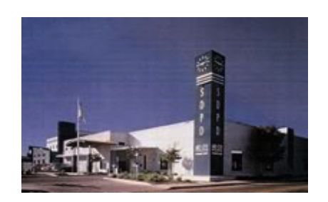
The Mid-City Police Substation

Additionally, there was early "buy in" from all parties involved to build out the master plan once it was developed. Without the involvement of Price Charities leading the parties toward a shared vision of neighborhood redevelopment, all agree that the revitalization of City Heights would not have happened. This statement is not intended as an indictment of the City or the San Diego Redevelopment Agency. Price Charities was specifically organized to serve an extremely vital role not under the mandate of city departments nor the redevelopment agency, and was staffed with a passionate team of experts with the skills, background, and resources necessary to execute win-win solutions for all parties involved.