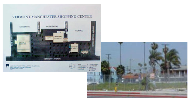
The Future Site of the Vermont-Manchester Shopping Center

Removal of blight through new school development is directly related to economic development and neighborhood revitalization. In addition to providing a much-needed resource to communities, new schools can serve as a catalytic project, demonstrate positive change and help to attract additional investments. By making strategic public investments on a previously blighted site, the result will give a private investor more confidence in the economic potential of that area.