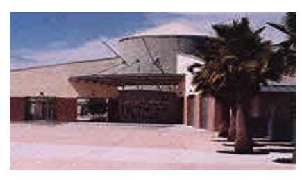
Rosa Parks Elementary School

The overall importance of the new school was not as an attraction for new investors; rather it was intended to provide an economically vibrant community for the benefit of the people who already lived in the neighborhood. The resulting increase in median home values is astounding. In 1996, prior to implementation of the Urban Village initiatives median home values were approximately $80,000. Today, the entry price for a single-family home is $160,000. While this is great news for the City Heights community, there is a concentrated effort to ensure that quality affordable housing is built so that residents of City Heights can remain in the community.