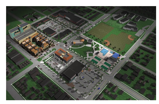
Urban Village Master Plan

In order to expedite construction of the substation, Price Charities, the non-profit entity of the Price REIT, agreed to lend funds to the City for building the substation. In exchange, the City agreed to incorporate the substation in the Urban Village master plan and to relate the building design to the community.